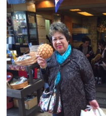
Asakusa Famous Melon Pan