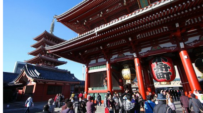
Asakusa Kannon Temple